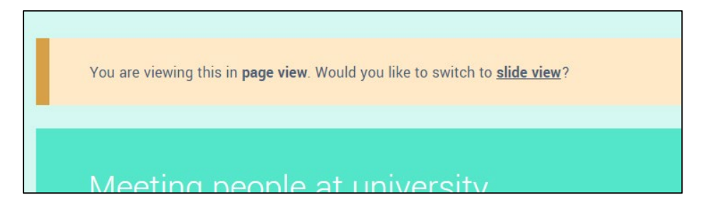
Fig. 2. Ability to switch between page view and slide view

A simple interactive feature that appealed to all participants was the option of viewing longer text either as a single page or divided into smaller sections, with quick links at the top of the toolkit item.